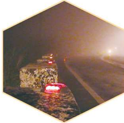
Mountain side Fog lights for guided road and highways