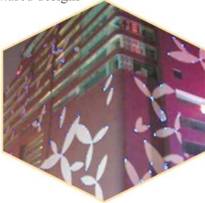
Enhanced Building Appearances by illuminating featured designs