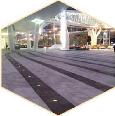
Commercial areas lighted paths