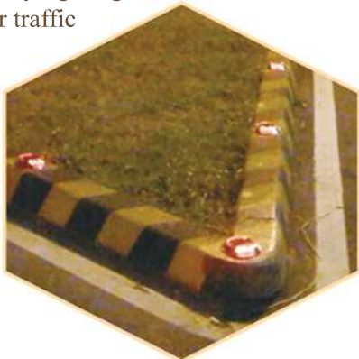
Road ramps boundary lighting for visual and safer traffic