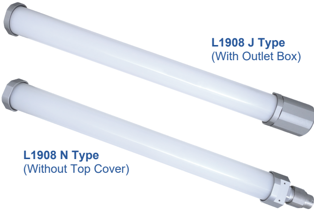
L1908 J Type (With Outlet Box)